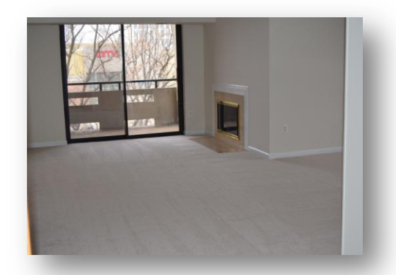
Large Living Room with wood burning Fireplace