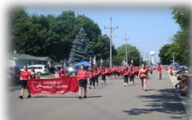
Yearly 4 th of July Parade