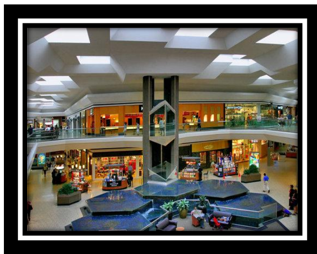
10 minutes from Fair Oaks Mall