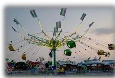
Yearly Fairfax Fair