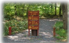
Tons of Parks in Fairfax County