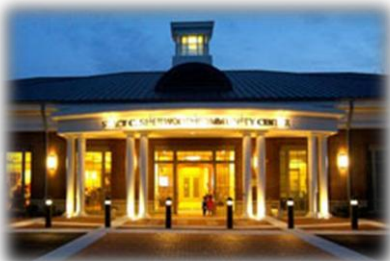
Fairfax Community Center