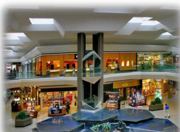
Tons of shopping and restaurants