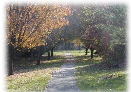
13 Miles of Trails