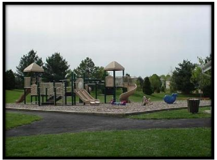
14 tots located within the community