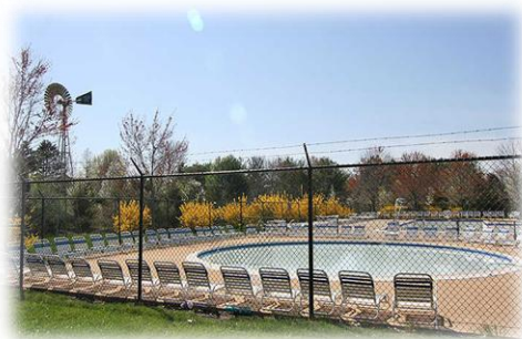
1 of 2 Swimming Pools