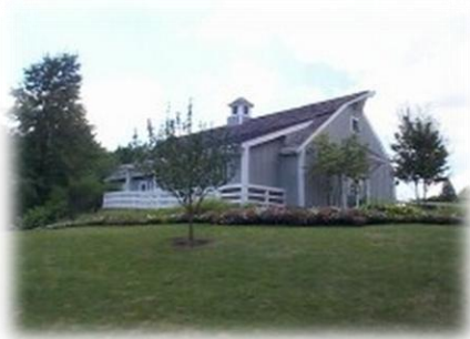
Still Pond Community Center