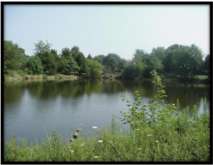
One of many beautiful ponds