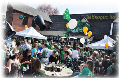
Annual Irish festival at Local Restaurant