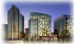
10 minutes from Tysons Corner