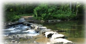
Miles of beautiful trails