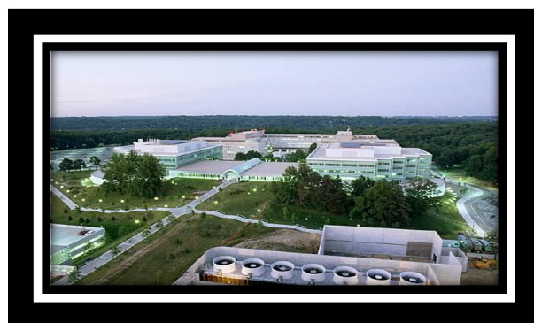
CIA – Great Falls, VA