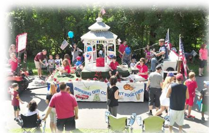
Annual 4 th of July festival