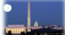
20 minutes from Washington DC