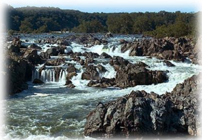
Great Falls Park