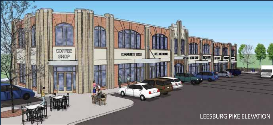
LEESBURG PIKE ELEVATION

LOCATION: 7121 Leesburg Pike, Falls Church, VA PROJECT SIZE: 15,250 SF Total 7,625 SF Retail & 7,625 SF Office PARKING: 67 Spaces TRAFFIC: 43,000 VPD (Rte 7) USES: Office/Medical Condo ACCESS: Ingress on Chesnut St, egress easement access through 7115 Leesburg Pike to Shreve traffic signal CLOSE PROXIMITY: Giant Food, McDonald's, United Bank, W Falls Church Metro, Falls Church City High School